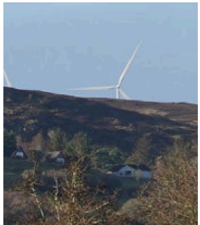
Likely view of the turbines looking south

As well as the proposed power lines some residents of Rogart may be unaware of new Windfarm proposals from the company Energy Kontor (EK) for Acheildh Estate. A public exhibition was held by EK in Rogart Hall on 16th