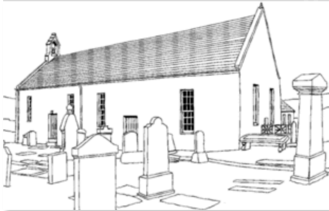
St Callan's, Rogart