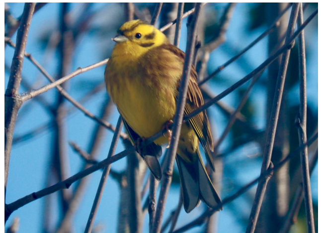
Yellowhammer (I think) - ed

Has anyone seen a Yellowhammer lately ? it would be good to know. There are no Swifts and Swallow and House Martin Numbers are very sparse. Sand Martin numbers are low, but rely to a great extent on river levels for a successful season. Our small Rook colony holds on despite constant harassment by the overpopulation of Jackdaws and "Apex Predators" are thriving. Being something of an insomniac I have watched Bat numbers fall from low to this years ZERO !