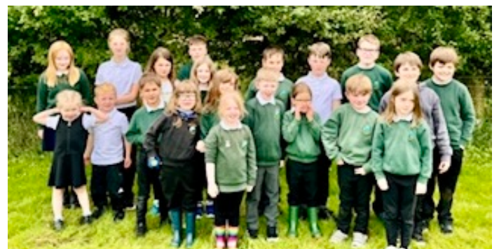
Classes of 2024

We are delighted to have 21 pupils in our school this year and have 4 children in nursery. Keeping our school alive with 2 full time teachers is our priority and we need at least 20 pupils to do this.